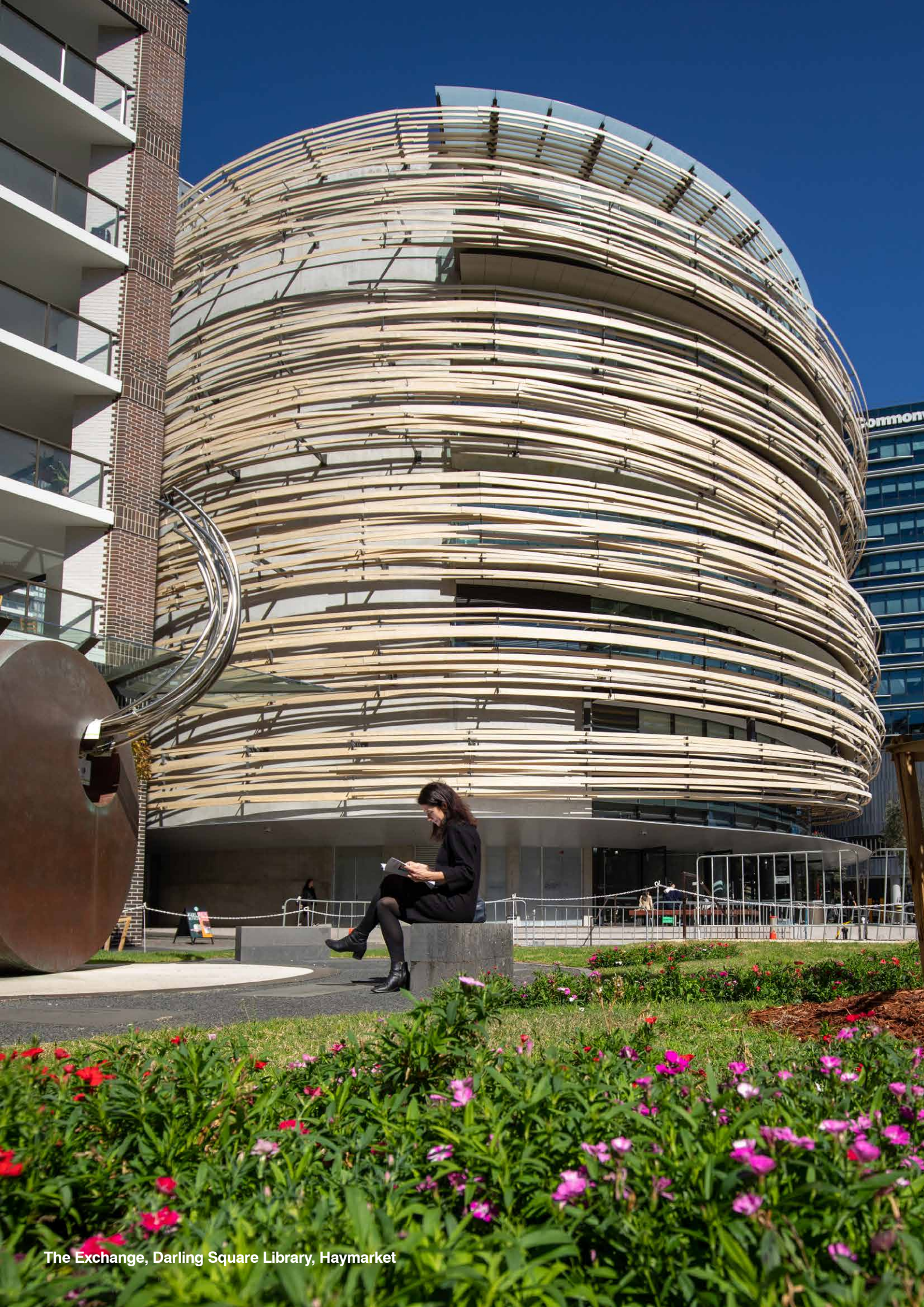
The Exchange, Darling Square Library, Haymarket