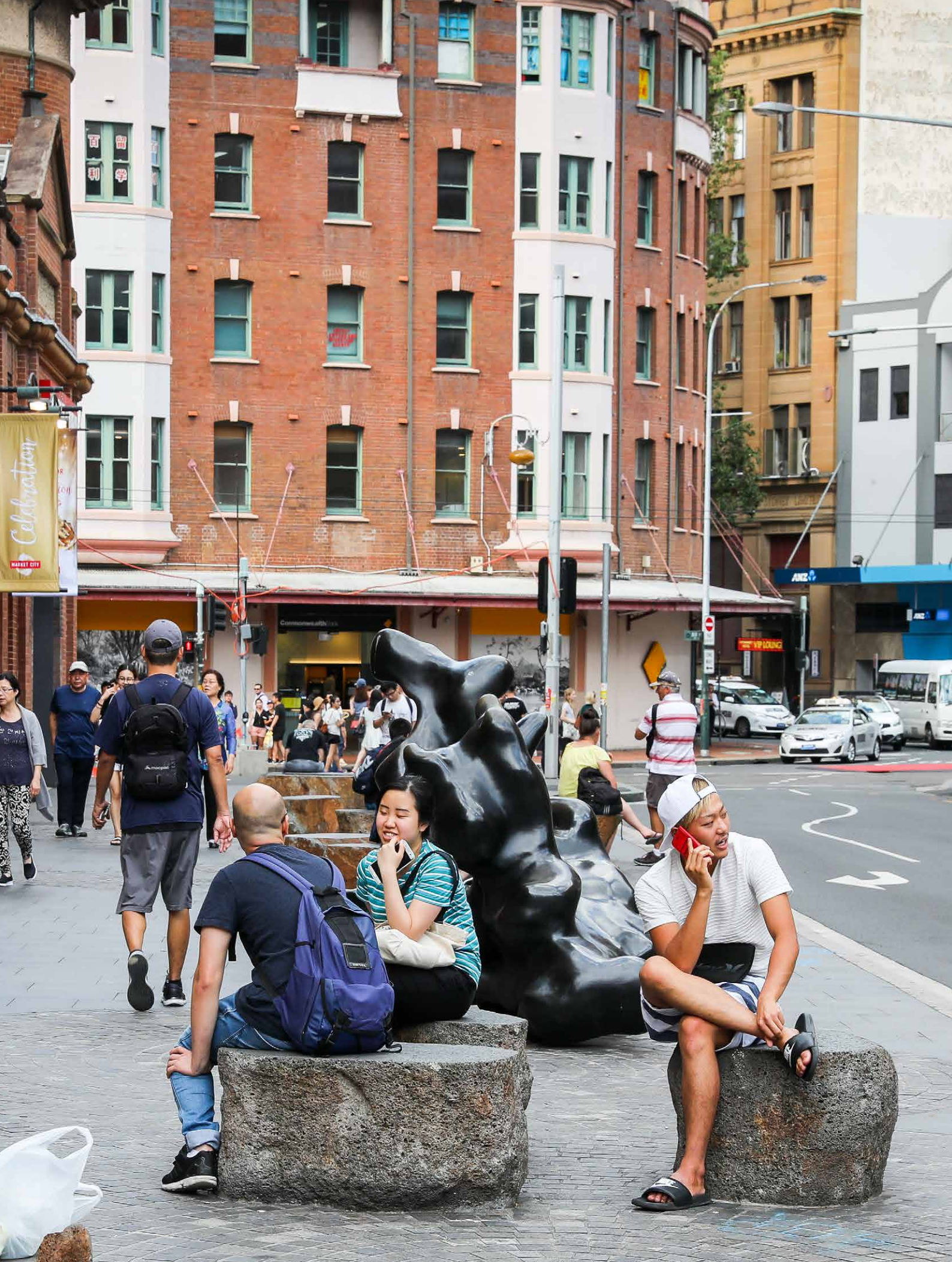
Chinatown, Thomas Street, Haymarket