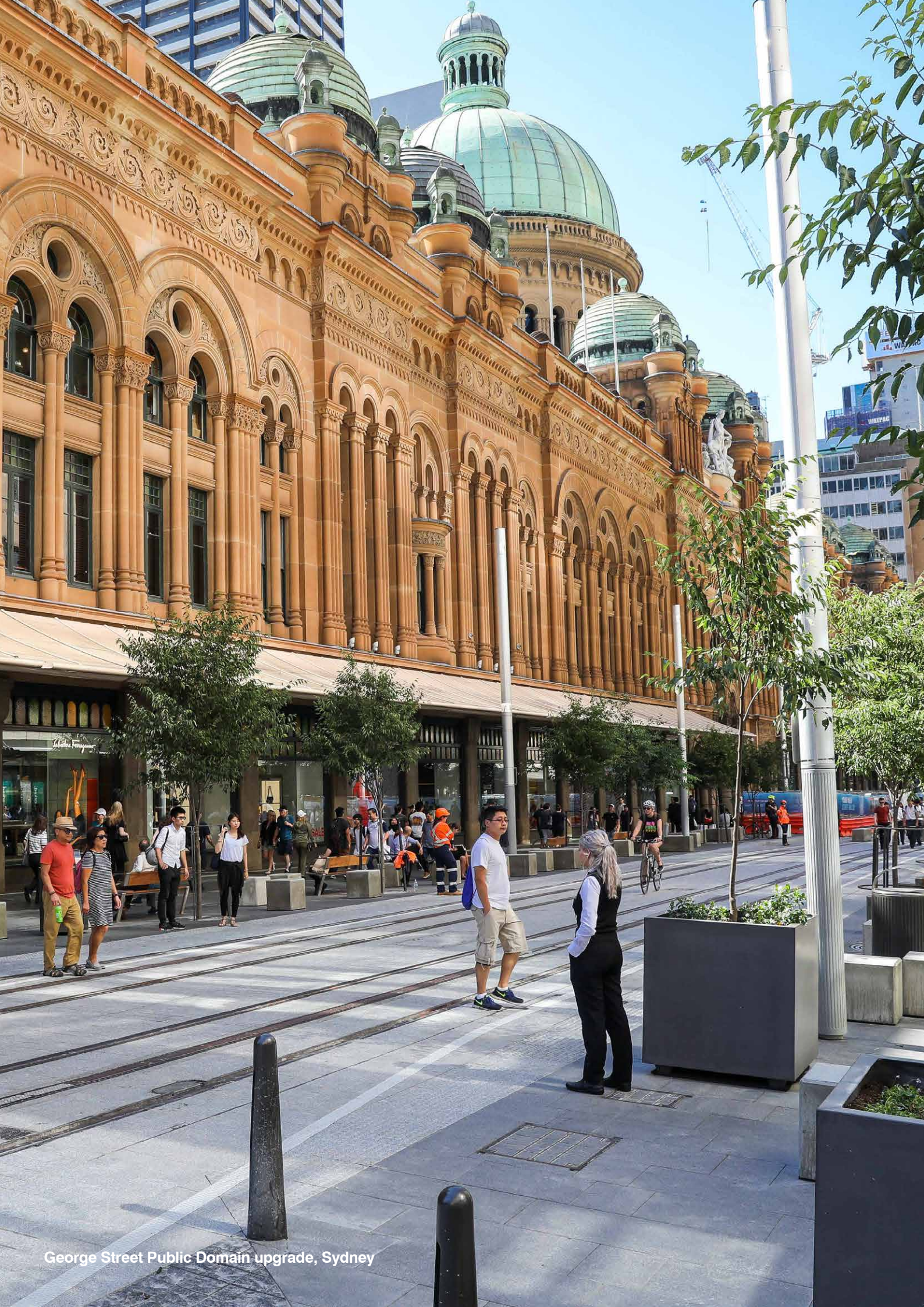
George Street Public Domain upgrade, Sydney