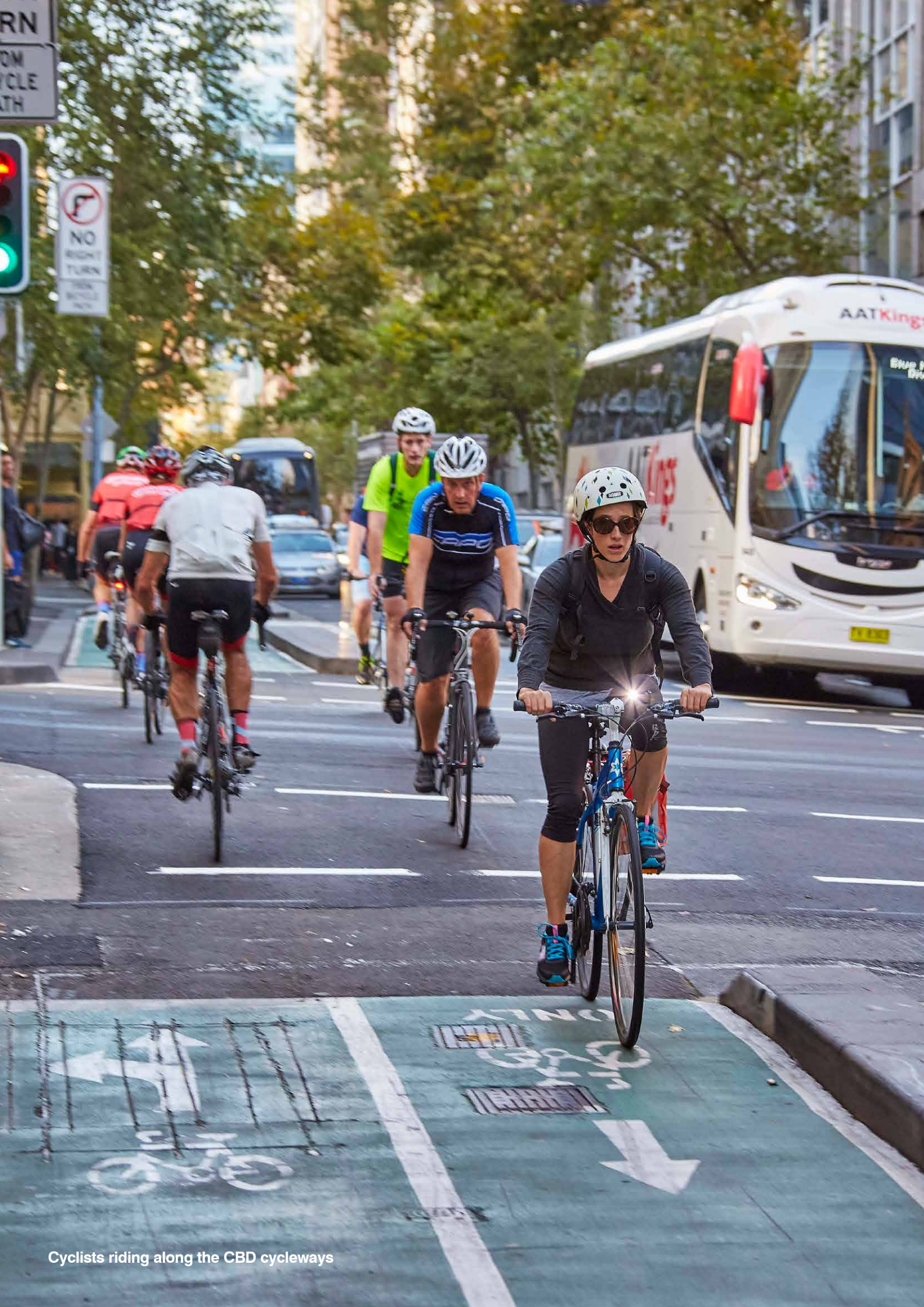
Cyclists riding along the CBD cycleways