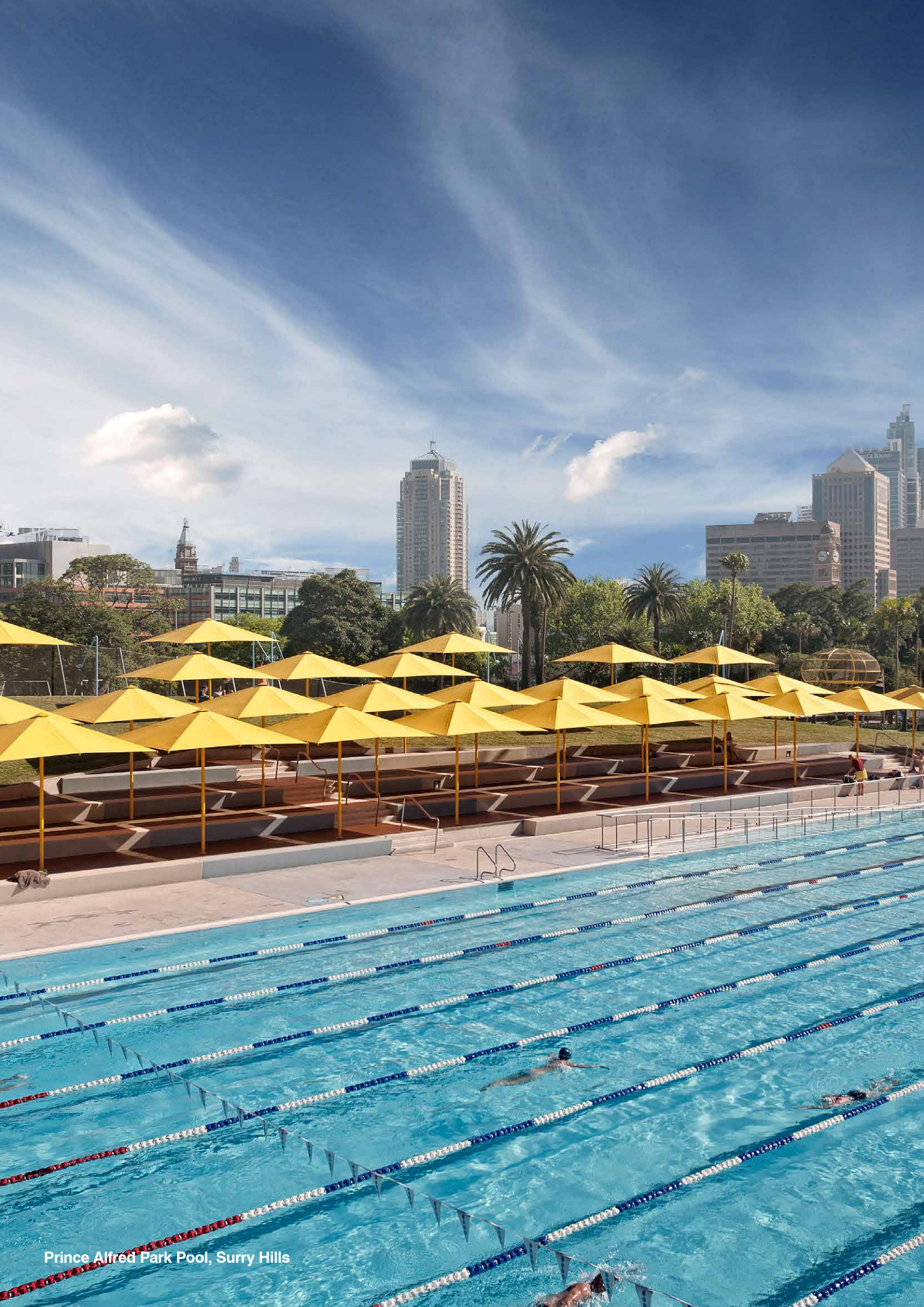
Prince Alfred Park Pool, Surry Hills