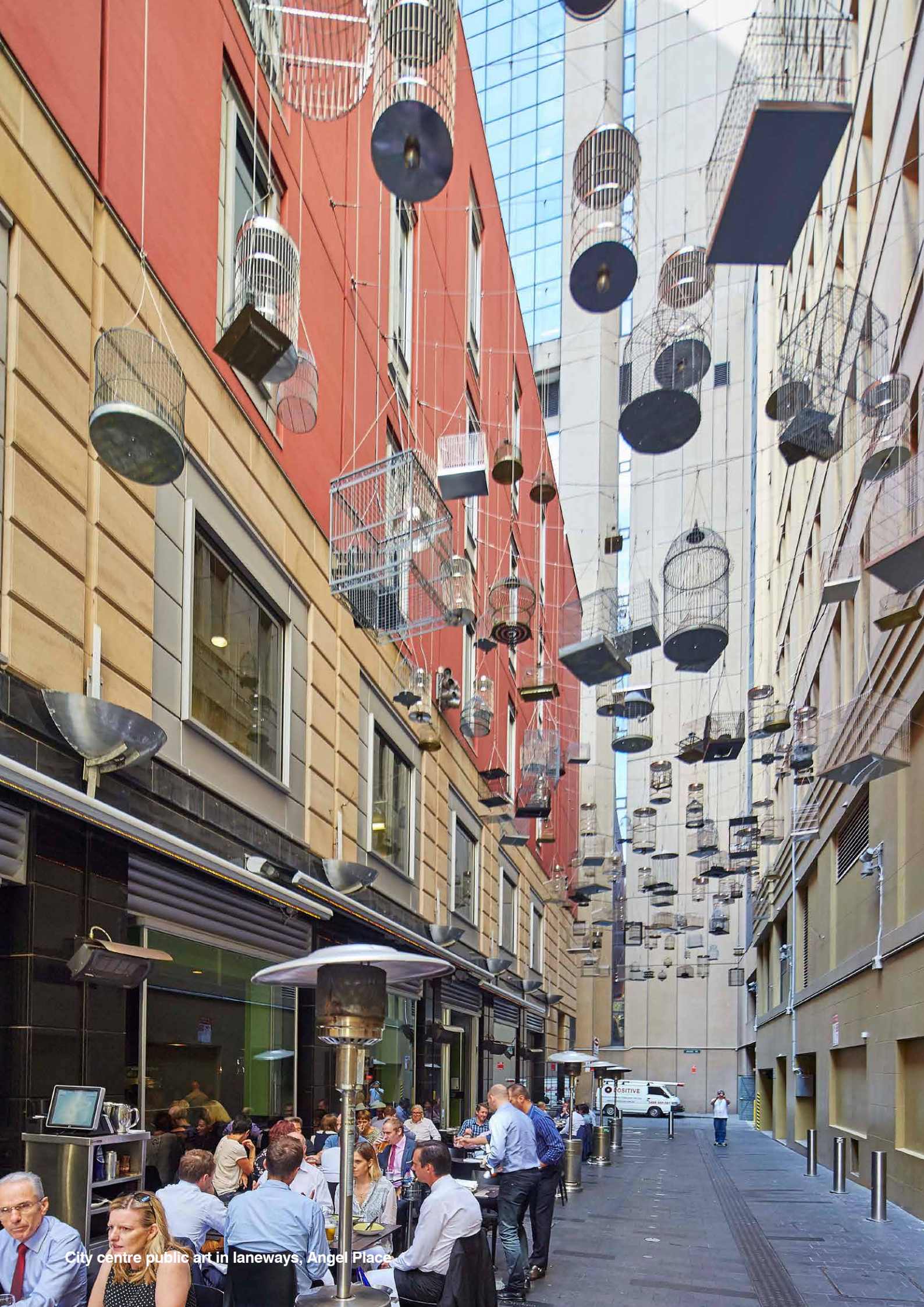
City centre public art in laneways, Angel Place